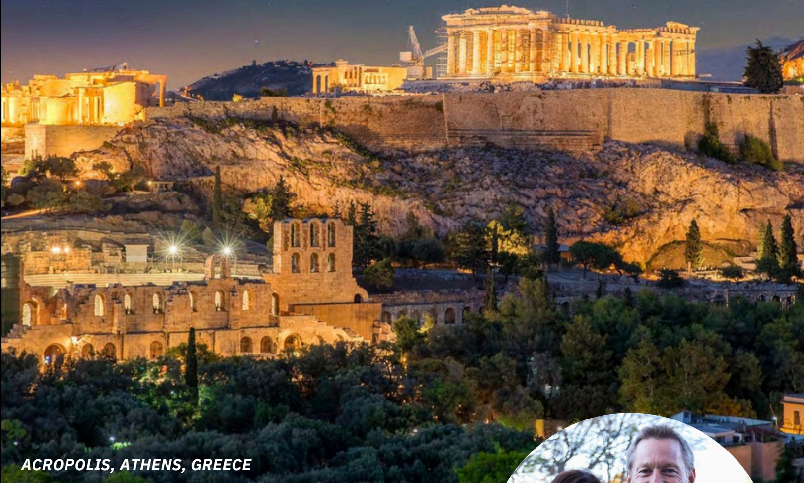
ACROPOLIS, ATHENS, GREECE

We hope you'll join us as we explore the ancient paths of Paul's missionary journeys through Greece and Turkey. Walk in the footsteps of this influential figure as you visit iconic sites such as Athens, Corinth, Ephesus, and Thessaloniki. Experience the rich history and cultural significance of these destinations, where Paul spread the teachings of Christianity. From the modern museums to the ruins of ancient temples, this tour offers a unique opportunity to immerse yourself in the legacy of Paul's travels along the Aegean Sea, and enjoy luxury hotel accommodations and three nights aboard a cruise ship. Inspired teachings, Christian fellowship, fabulous cuisine, breathtaking sights, and a lifetime of memories await you!