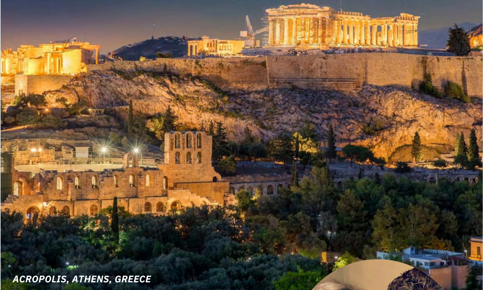
ACROPOLIS, ATHENS, GREECE

We hope you'll join me as we explore the ancient paths of Paul's missionary journeys through Greece and Turkey. Walk in the footsteps of this influential figure as you visit iconic sites such as Athens, Corinth, Ephesus, and Thessaloniki. Experience the rich history and cultural significance of these destinations, where Paul spread the teachings of Christianity. From the modern museums to the ruins of ancient temples, this tour offers a unique opportunity to immerse yourself in the legacy of Paul's travels along the Aegean Sea, and enjoy knowledgeable guides, luxury hotel accommodations, and three nights aboard a cruise ship. Inspired teachings, Christian fellowship, fabulous cuisine, and breathtaking sights. A lifetime worth of memories await you!