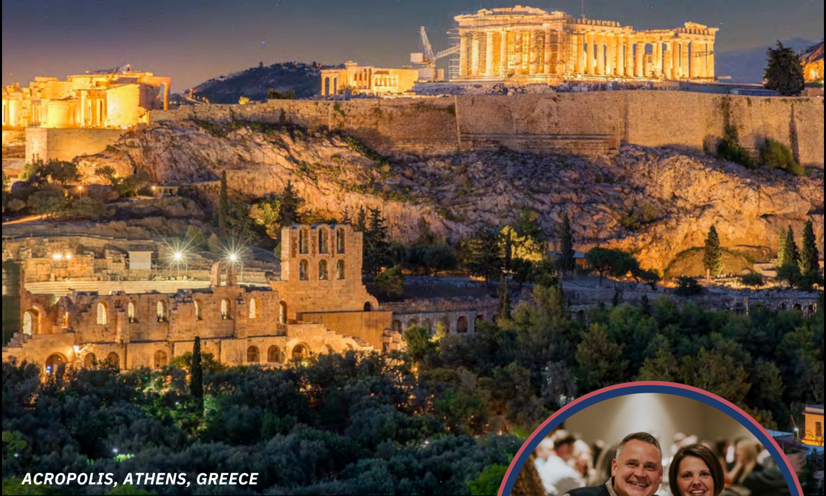
ACROPOLIS, ATHENS, GREECE

We hope you'll join us as we explore the ancient paths of Saint Paul's missionary journeys through Greece and Turkey. Walk in the footsteps of this influential figure as you visit iconic sites such as Athens, Corinth, Ephesus, and Thessaloniki. Experience the rich history and cultural significance of these destinations, where Paul spread the teachings of Christianity. From the modern museums to the ruins of ancient temples, this tour offers a unique opportunity to immerse yourself in the legacy of Paul's travels along the Aegean Sea, and enjoy knowledgeable guides, luxury hotel accommodations, and three nights aboard a cruise ship. Inspired teachings, Christian fellowship, fabulous cuisine, and breathtaking sights. A lifetime worth of memories awaits you!