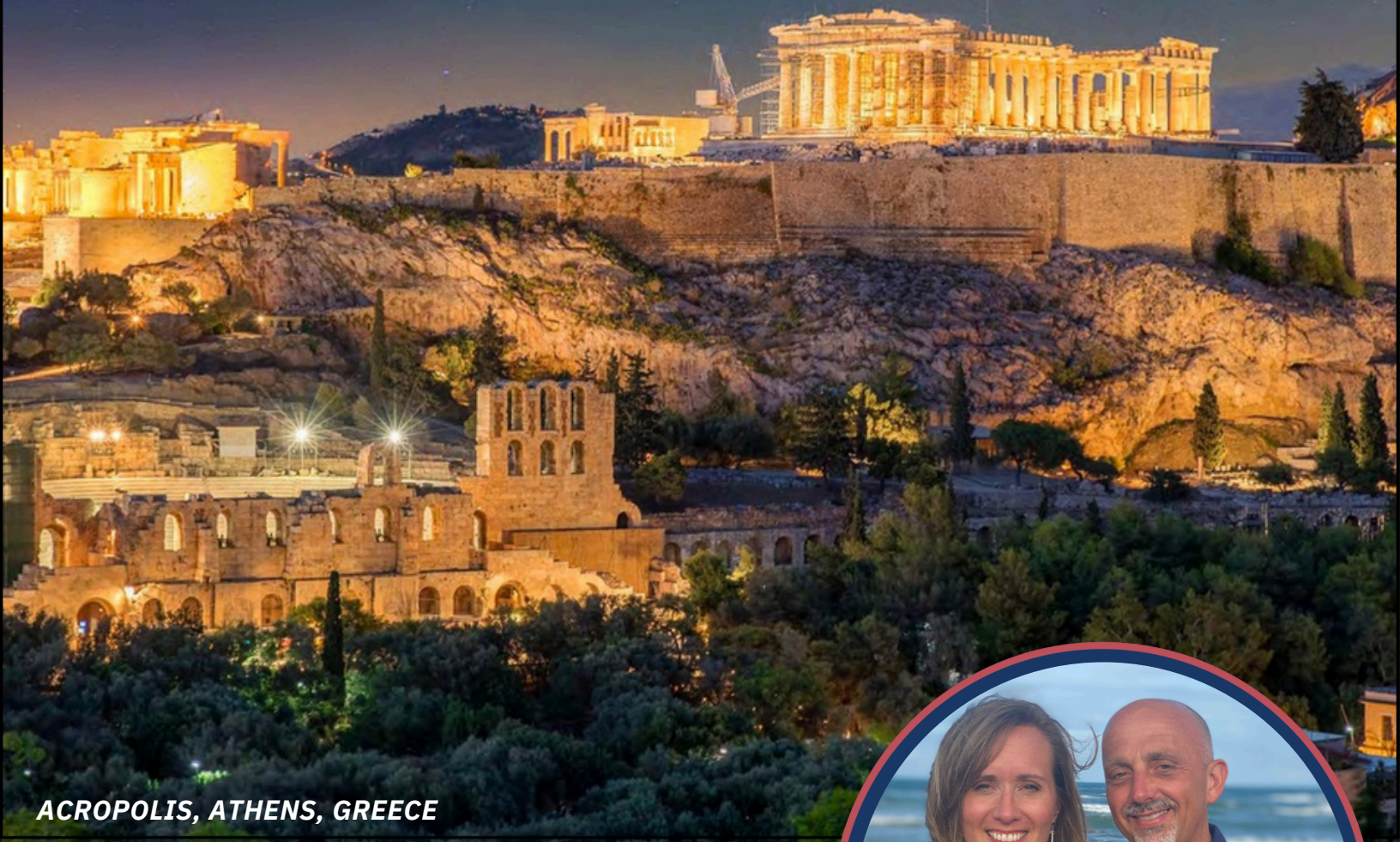
ACROPOLIS, ATHENS, GREECE

We hope you'll join us as we explore the ancient paths of Paul's missionary journeys through Greece and Turkey. Walk in the footsteps of this influential figure as you visit iconic sites such as Athens, Corinth, Ephesus, and Thessaloniki. Experience the rich history and cultural significance of these destinations, where Paul spread the teachings of Christianity. From the modern museums to the ruins of ancient temples, this tour offers a unique opportunity to immerse yourself in the legacy of Paul's travels along the Aegean Sea, and enjoy luxury hotel accommodations and three nights aboard a cruise ship. Inspired teachings, Christian fellowship, fabulous cuisine, breathtaking sights, and a lifetime of memories await you!