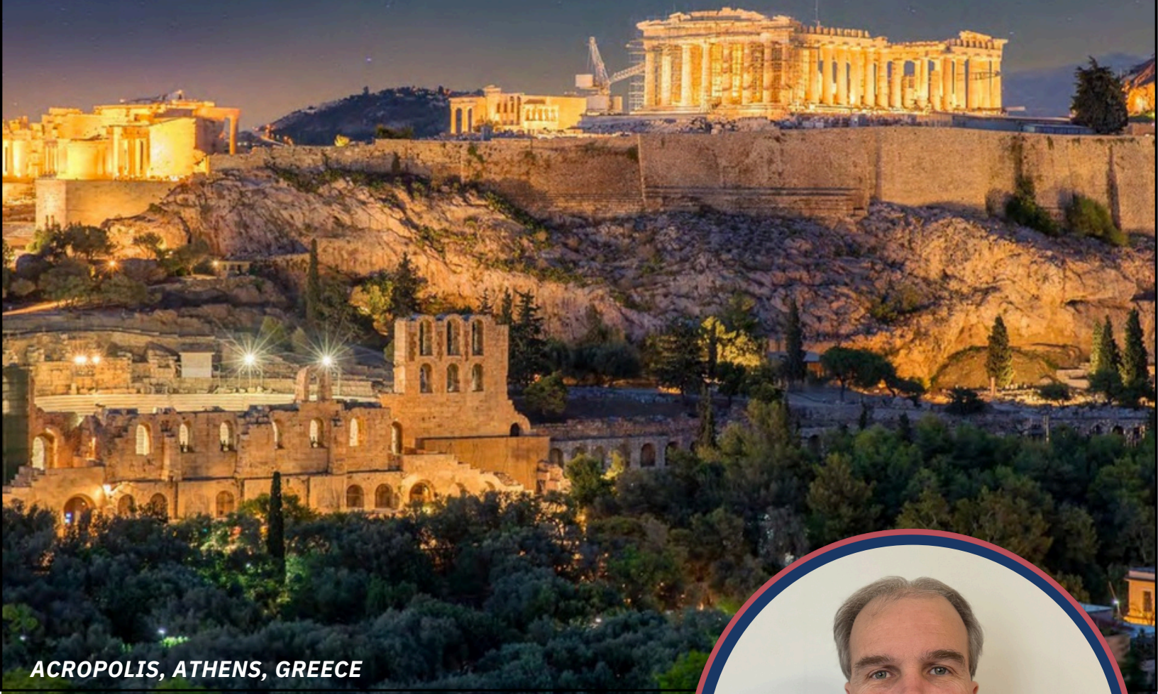
ACROPOLIS, ATHENS, GREECE

I hope you'll join me as we explore the ancient paths of Paul's missionary journeys through Greece and Turkey. Walk in the footsteps of this influential figure as you visit iconic sites such as Athens, Corinth, Ephesus, and Thessaloniki. Experience the rich history and cultural significance of these destinations, where Paul spread the teachings of Christianity. From the modern museums to the ruins of ancient temples, this tour offers a unique opportunity to immerse yourself in the legacy of Paul's travels along the Aegean Sea, and enjoy knowledgeable guides, luxury hotel accommodations, and three nights aboard a cruise ship. Inspired teachings, Christian fellowship, fabulous cuisine, and breathtaking sights. A lifetime worth of memories await you!