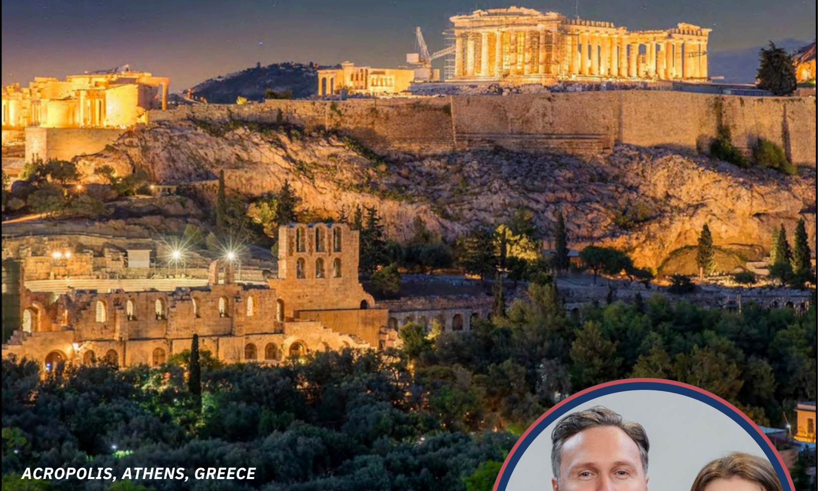
ACROPOLIS, ATHENS, GREECE

We hope you'll join us as we explore the ancient paths of Saint Paul's journeys through Greece and Italy. Walk in the footsteps of this influential figure as you visit iconic sites such as Athens, Corinth, Thessaloniki, and Rome.