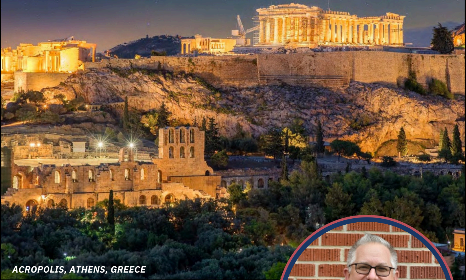
ACROPOLIS, ATHENS, GREECE

We hope you'll join us as we explore the ancient paths of Paul's missionary journeys through Greece and Turkey. Walk in the footsteps of this influential figure as you visit iconic sites such as Athens, Corinth, Ephesus, and Thessaloniki. Experience the rich history and cultural significance of these destinations, where Paul spread the teachings of Christianity. From the modern museums to the ruins of ancient temples, this tour offers a unique opportunity to immerse yourself in the legacy of Paul's travels along the Aegean Sea, and enjoy knowledgeable guides, luxury hotel accommodations, and three nights aboard a cruise ship. Inspired teachings, Christian fellowship, fabulous cuisine, and breathtaking sights. A lifetime worth of memories awaits you!