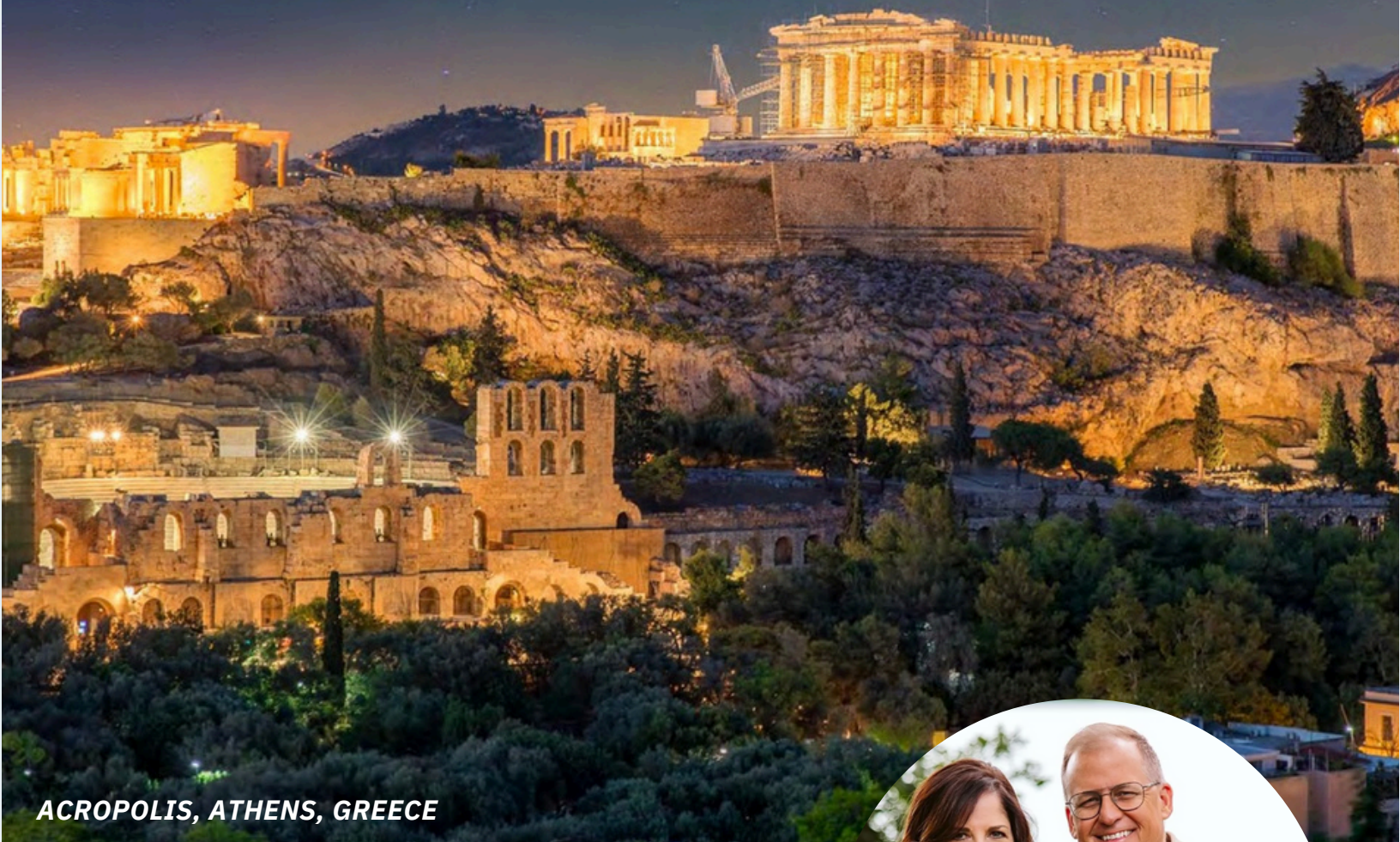
ACROPOLIS, ATHENS, GREECE

We hope you'll join us as we explore the ancient paths of Paul's missionary journeys through Greece and Turkey. Walk in the footsteps of this influential figure as you visit iconic sites such as Athens, Corinth, Ephesus, and Thessaloniki. Experience the rich history and cultural significance of these destinations, where Paul spread the teachings of Christianity. From the modern museums to the ruins of ancient temples, this tour offers a unique opportunity to immerse yourself in the legacy of Paul's travels along the Aegean Sea, and enjoy knowledgeable guides, luxury hotel accommodations, and three nights aboard a cruise ship. Inspired teachings, Christian fellowship, fabulous cuisine, and breathtaking sights. A lifetime worth of memories awaits you!