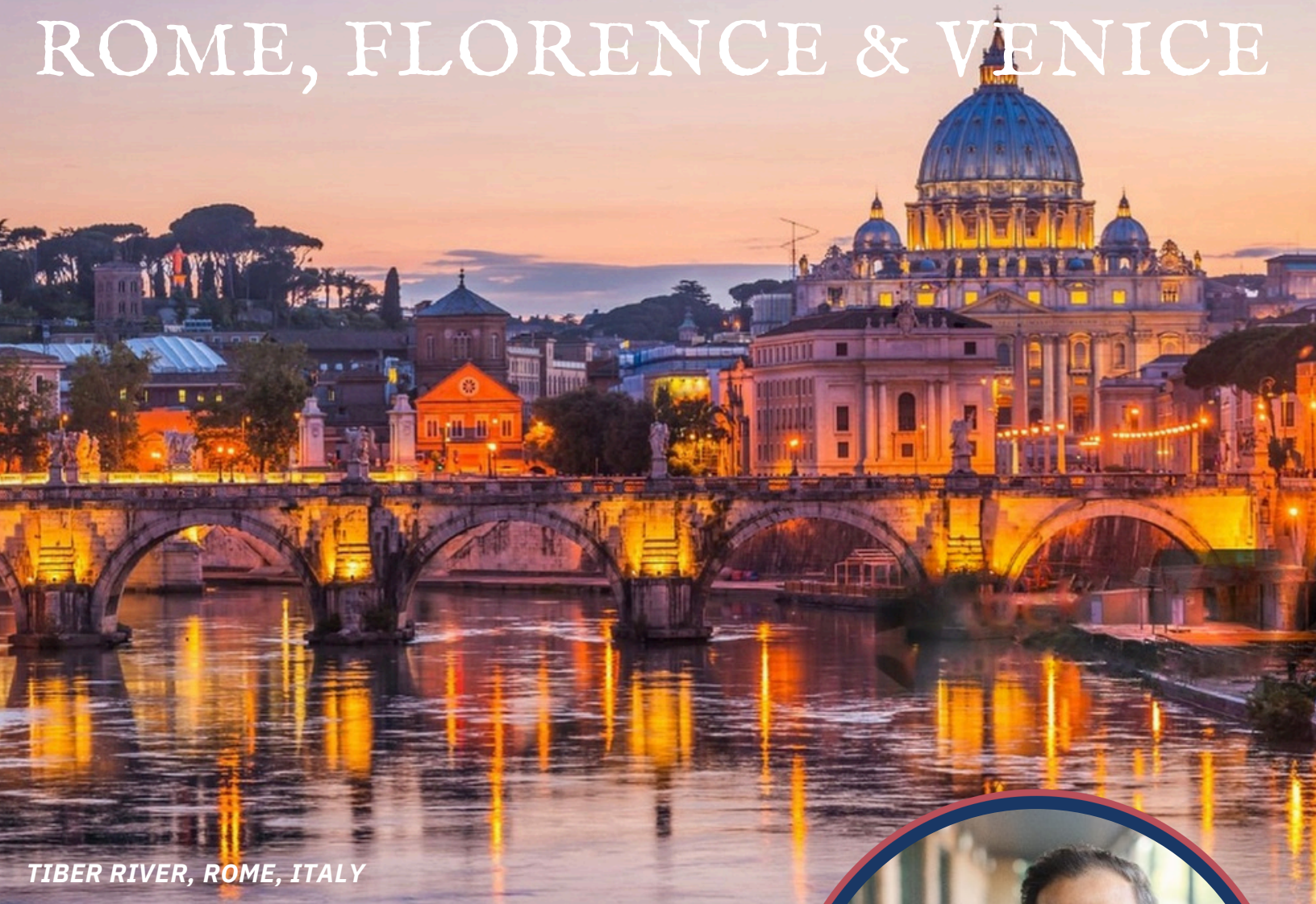
TIBER RIVER, ROME, ITALY

We hope you'll join us as we explore the beautiful wonders of Italy. Experience the rich history and cultural significance of these destinations, where the teachings of Christianity have inspired magnificent art and architecture for centuries. From the modern museums to picturesque scenery, this tour offers a unique opportunity to immerse yourself in the varied splendors of Italy, and to enjoy knowledgeable guides, luxury hotel accommodations, inspired teaching, Christian fellowship, fabulous cuisine, and breathtaking sights. A lifetime worth of memories awaits you!