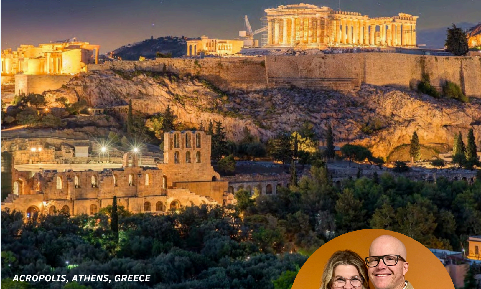
ACROPOLIS, ATHENS, GREECE

We hope you'll join us as we explore the ancient paths of Paul's missionary journeys through Greece and Turkey. Walk in the footsteps of this influential figure as you visit iconic sites such as Athens, Corinth, Ephesus, and Thessaloniki. Experience the rich history and cultural significance of these destinations, where Paul spread the teachings of Christianity. From the modern museums to the ruins of ancient temples, this tour offers a unique opportunity to immerse yourself in the legacy of Paul's travels along the Aegean Sea, and enjoy knowledgeable guides, luxury hotel accommodations, and three nights aboard a cruise ship. Inspired teachings, Christian fellowship, fabulous cuisine, and breathtaking sights. A lifetime worth of memories awaits you!