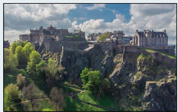
STIRLING CASTLE EDINBURGH GLASGOW ! LINDISFARNE (HOLY ISLAND) Newcastle upon Tyne DURHAM CATHEDRAL ORK MINSTER CATHEDRAL Hull* MANCHESTER. Stoke-on-Trent Nottingham* Norwich* Peterborough* BIRMINGHAM. STRATFORD-UPON-AVON Cardiff* Bath. SALISBURY CATHEDRAL Brighton* Portsmouth.