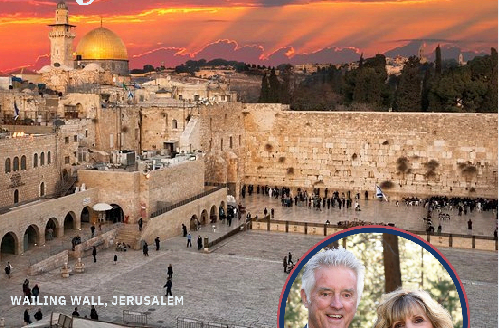
WAILING WALL, JERUSALEM

Experience the rich history and cultural significance of Israel, where the Cornerstone of our Faith taught the way to salvation and made it possible through His loving sacrifice. Embark upon a journey exploring the breathtaking sites integral to the life and death of Jesus of Nazareth, and discover the meaning behind these historical landmarks as you walk in the footsteps of the most influential man in history! Explore the wonders of the Holy Land with its natural beauty and unique architecture, while enjoying inspirational teaching, Christian fellowship, luxury accommodations and splendid cuisine! A lifetime of memories await you!