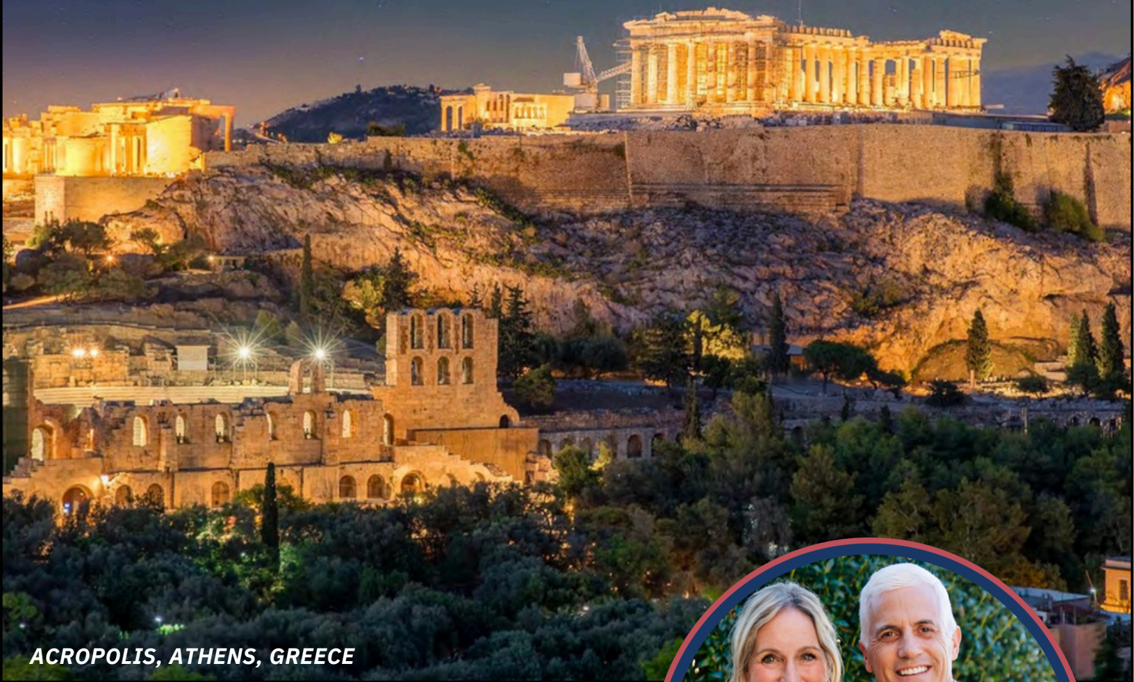
ACROPOLIS, ATHENS, GREECE

We hope you'll join us as we explore the ancient paths of Paul's missionary journeys through Greece and Turkey. Walk in the footsteps of this influential figure as you visit iconic sites such as Athens, Corinth, Ephesus, and Thessaloniki. Experience the rich history and cultural significance of these destinations, where Paul spread the teachings of Christianity. From the modern museums to the ruins of ancient temples, this tour offers a unique opportunity to immerse yourself in the legacy of Paul's travels along the Aegean Sea, and enjoy luxury hotel accommodations and three nights aboard a cruise ship. Inspired teachings, Christian fellowship, fabulous cuisine, breathtaking sights, and a lifetime of memories await you!