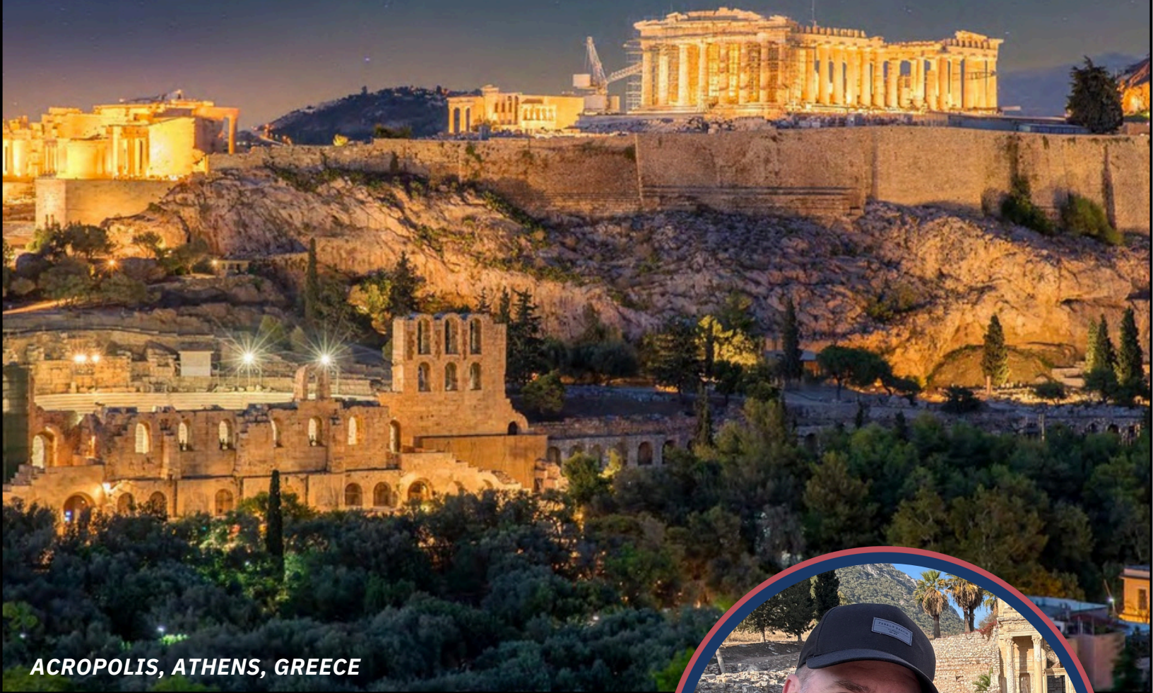
ACROPOLIS, ATHENS, GREECE

We hope you'll join us as we explore the ancient paths of Paul's missionary journeys through Greece and Turkey. Walk in the footsteps of this influential figure as you visit iconic sites such as Athens, Corinth, Ephesus, and Thessaloniki. Experience the rich history and cultural significance of these destinations, where Paul spread the teachings of Christianity. From the modern museums to the ruins of ancient temples, this tour offers a unique opportunity to immerse yourself in the legacy of Paul's travels along the Aegean Sea, and enjoy luxury hotel accommodations and three nights aboard a cruise ship. Inspired teaching, Christian fellowship, fabulous cuisine, breathtaking sights, and a lifetime of memories await you!