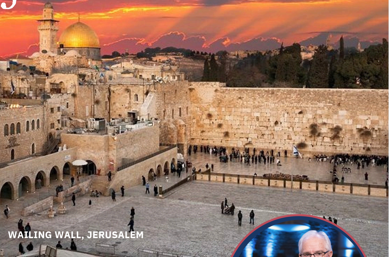
WAILING WALL, JERUSALEM