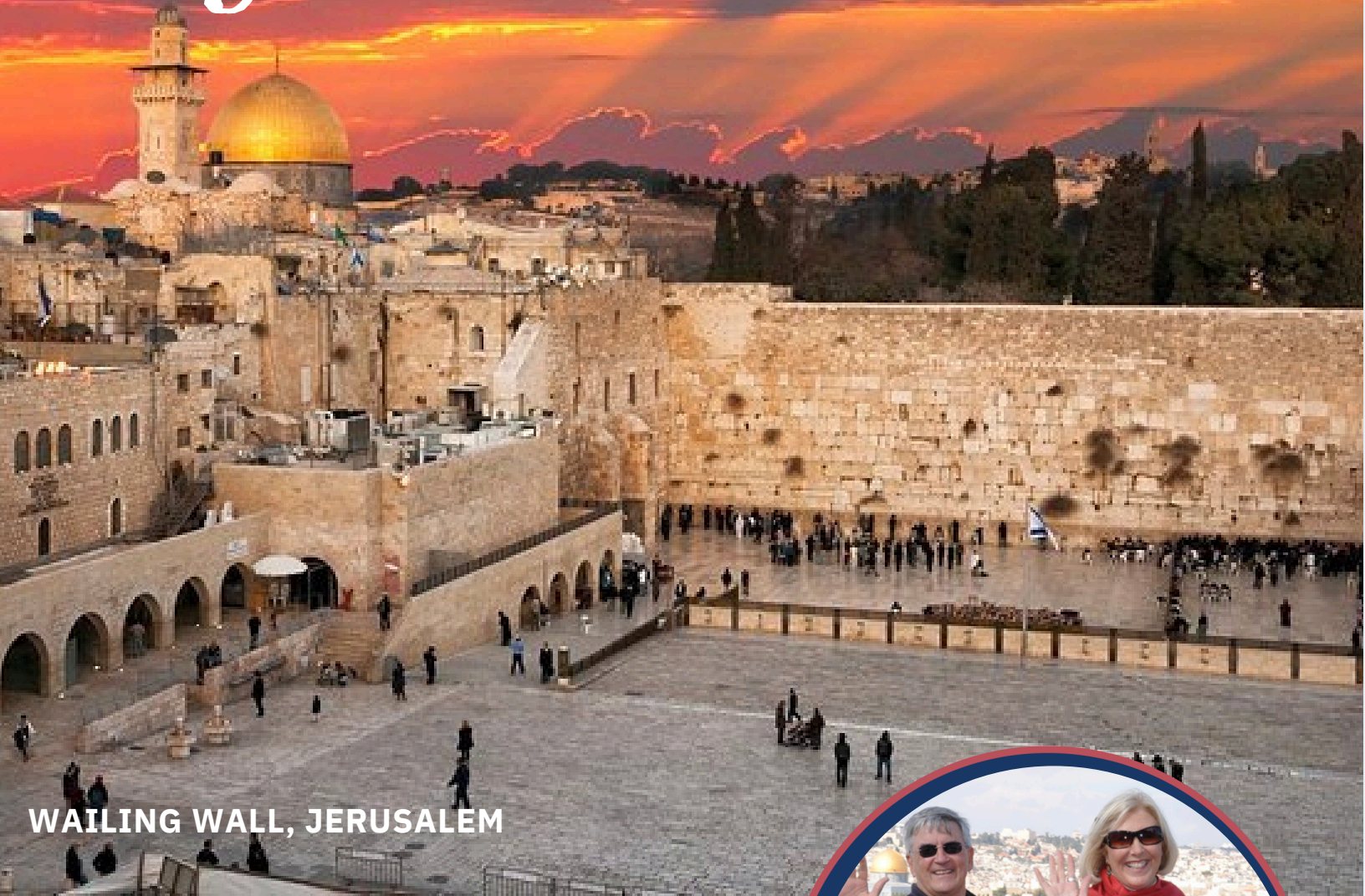
WAILING WALL, JERUSALEM

Experience the rich history and cultural significance of Israel, where the Cornerstone of our Faith taught the way to salvation and made it possible through His loving sacrifice. Embark upon a journey exploring the breathtaking sites integral to the life and death of Jesus of Nazareth, and discover the meaning behind these historical landmarks as you walk in the footsteps of the most influential man in history! Explore the wonders of the Holy Land with its natural beauty and unique architecture, while enjoying inspirational teaching, Christian fellowship, luxury accommodations and splendid cuisine! A lifetime of memories await you!