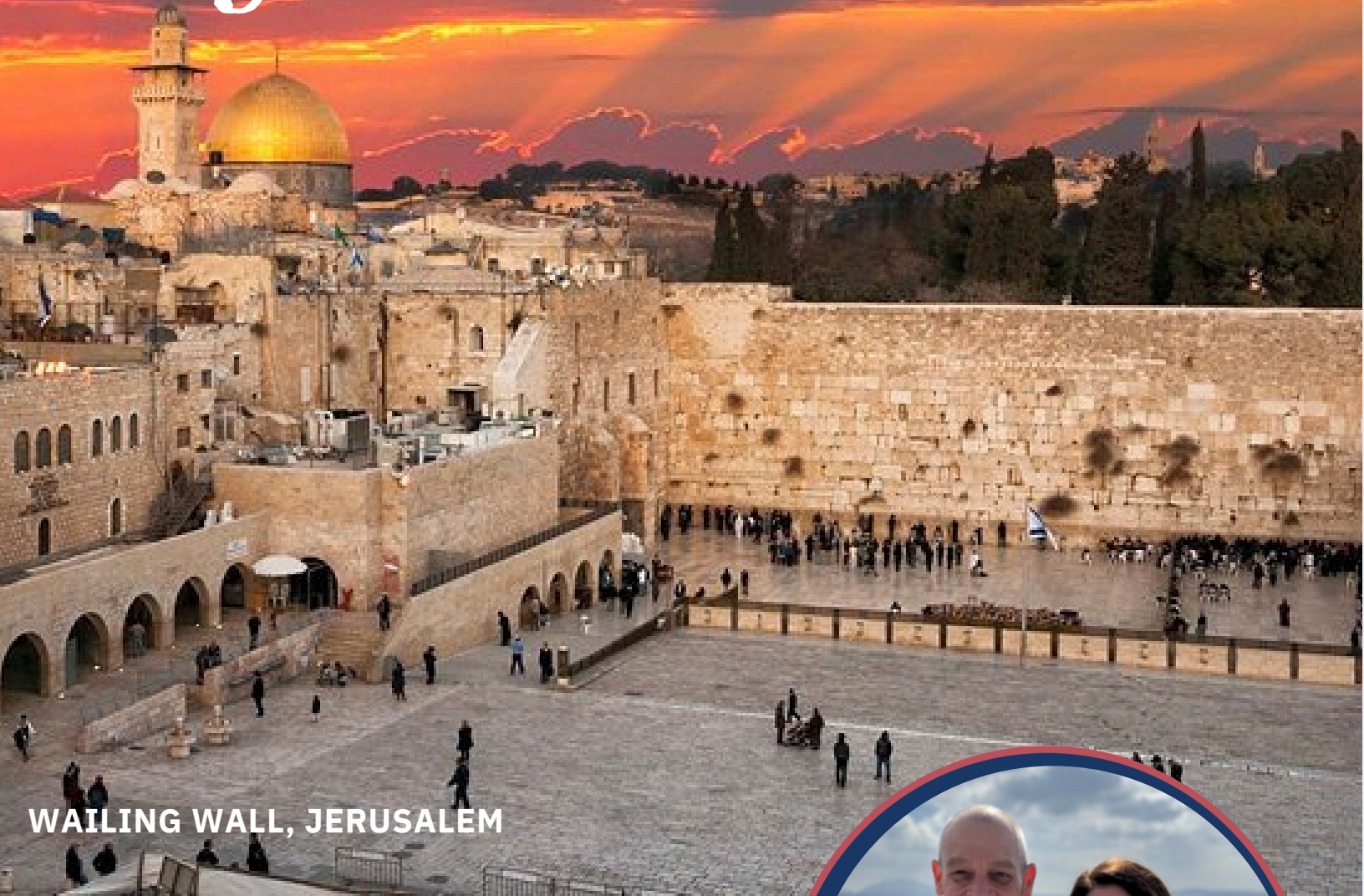
WAILING WALL, JERUSALEM

Experience the rich history and cultural significance of Israel, where the Cornerstone of our Faith taught the way to salvation and made it possible through His loving sacrifice. Embark upon a journey exploring the breathtaking sites integral to the life and death of Jesus of Nazareth, and discover the meaning behind these historical landmarks as you walk in the footsteps of the most influential man in history! Explore the wonders of the Holy Land with its natural beauty and unique architecture, while enjoying inspirational teaching, Christian fellowship, luxury accommodations and splendid cuisine! A lifetime of memories await you!