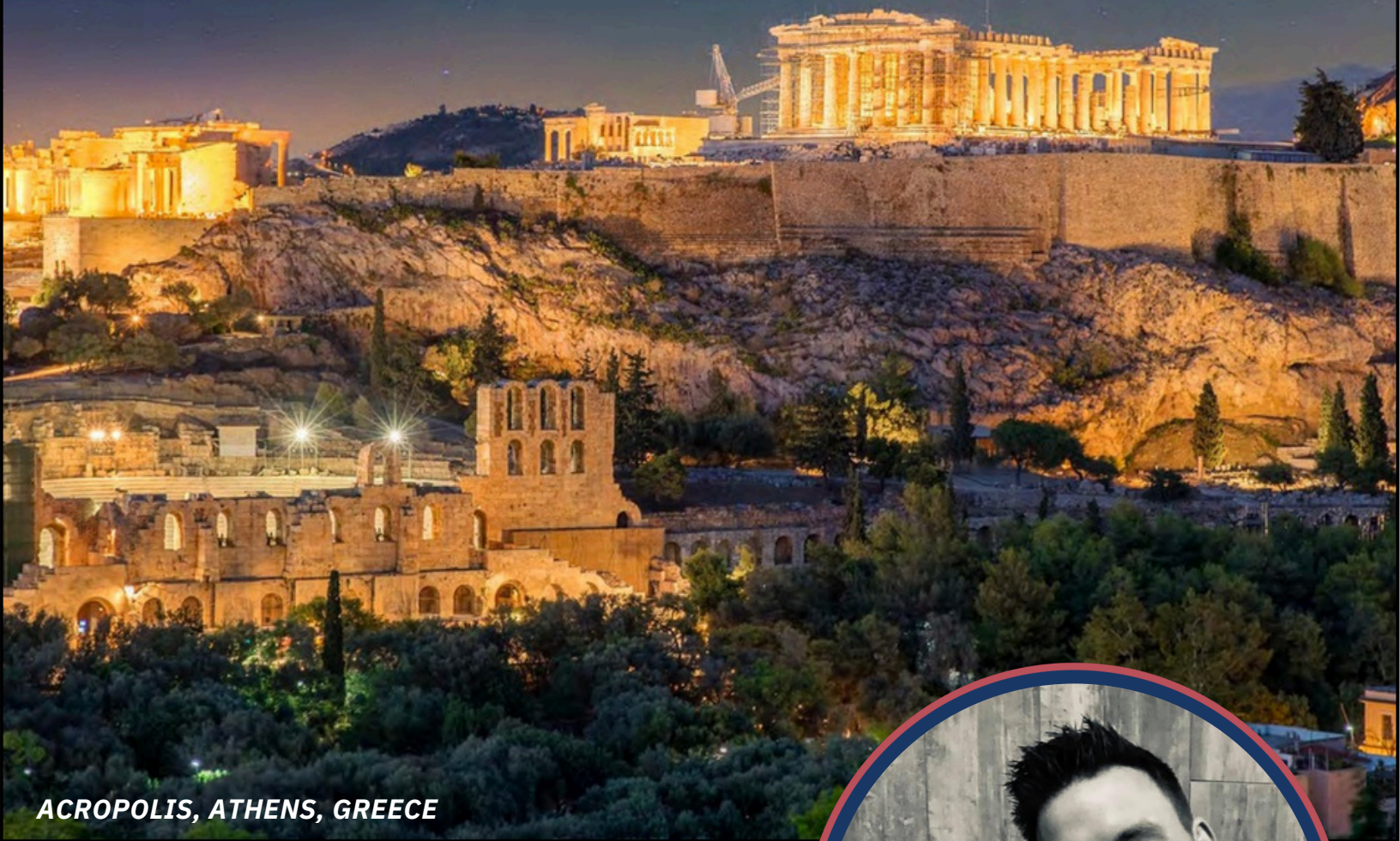
ACROPOLIS, ATHENS, GREECE

We hope you'll join us as we explore the ancient paths of Paul's missionary journeys through Greece and Turkey. Walk in the footsteps of this influential figure as you visit iconic sites such as Athens, Corinth, Ephesus, and Thessaloniki. Experience the rich history and cultural significance of these destinations, where Paul spread the teachings of Christianity. From the modern museums to the ruins of ancient temples, this tour offers a unique opportunity to immerse yourself in the legacy of Paul's travels along the Aegean Sea, and enjoy luxury hotel accommodations and three nights aboard a cruise ship. Inspired teaching, Christian fellowship, fabulous cuisine, breathtaking sights, and a lifetime of memories await you!