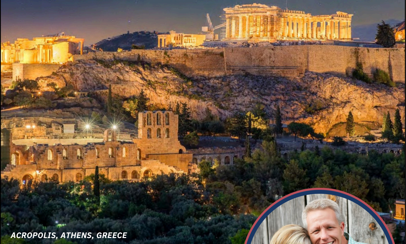
ACROPOLIS, ATHENS, GREECE

We hope you'll join us as we explore the ancient paths of Paul's missionary journeys through Greece and Turkey. Walk in the footsteps of this influential figure as you visit iconic sites such as Athens, Corinth, Ephesus, and Thessaloniki. Experience the rich history and cultural significance of these destinations, where Paul spread the Gospel of Jesus Christ. From the modern museums to the ruins of ancient temples, this tour offers a unique opportunity to immerse yourself in the legacy of Paul's travels along the Aegean Sea, and enjoy knowledgeable guides, luxury hotel accommodations, and three nights aboard a cruise ship. Inspired teachings, Christian fellowship, fabulous cuisine, and breathtaking sights. A lifetime worth of memories awaits you!