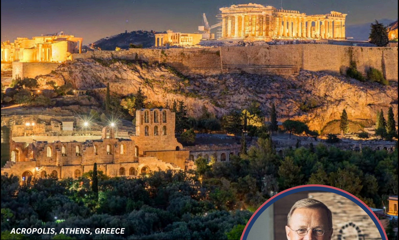
ACROPOLIS, ATHENS, GREECE

I hope you'll join me as I explore the ancient paths of Paul's missionary journeys through Greece and Turkey. Walk in the footsteps of this influential figure as you visit iconic sites such as Athens, Corinth, Ephesus, and Thessaloniki. Experience the rich history and cultural significance of these destinations, where Paul spread the teachings of Christianity. From the modern museums to the ruins of ancient temples, this tour offers a unique opportunity to immerse yourself in the legacy of Paul's travels along the Aegean Sea, and enjoy knowledgeable guides, luxury hotel accommodations, and three nights aboard a cruise ship. Inspired teachings, Christian fellowship, fabulous cuisine, and breathtaking sights. A lifetime worth of memories awaits you!