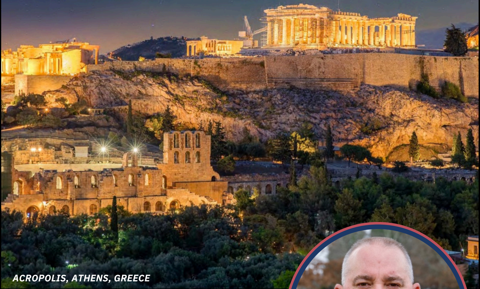
ACROPOLIS, ATHENS, GREECE

We hope you'll join us as we explore the ancient paths of Paul's missionary journeys through Greece and Turkey. Walk in the footsteps of this influential figure as you visit iconic sites such as Athens, Corinth, Ephesus, and Thessaloniki. Experience the rich history and cultural significance of these destinations, where Paul spread the teachings of Christianity. From the modern museums to the ruins of ancient temples, this tour offers a unique opportunity to immerse yourself in the legacy of Paul's travels along the Aegean Sea, and enjoy knowledgeable guides, luxury hotel accommodations, and three nights aboard a cruise ship. Inspired teachings, Christian fellowship, fabulous cuisine, and breathtaking sights. A lifetime worth of memories awaits you!