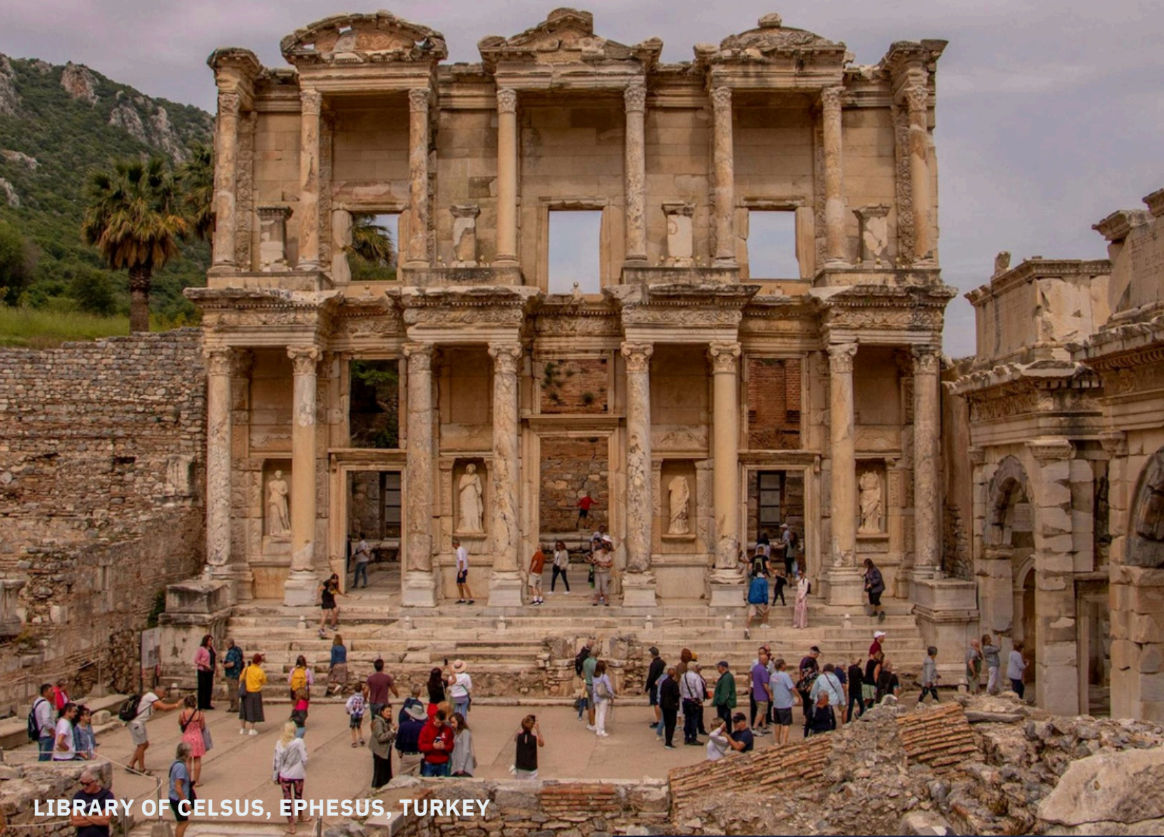
LIBRARY OF CELSUS, EPHESUS, TURKEY

We hope you'll join us as we embark on this captivating journey through Turkey! Your journey begins with three nights in the cosmopolitan city of Istanbul, including a guided tour of its magnificent architecture and famed indoor Grand Bazaar. You'll depart Istanbul and spend the remainder of your tour visiting the beautiful sites of the seven churches mentioned in the book of Revelation, where the history, spirituality and breathtaking landscapes of that region converge. You'll hear the special messages given to John regarding each church's unique ministry and mission, and gain a profound understanding of the challenges faced by the early believers. Inspired teaching, Christian fellowship, fabulous cuisine, breathtaking sights, and a lifetime of memories await you!