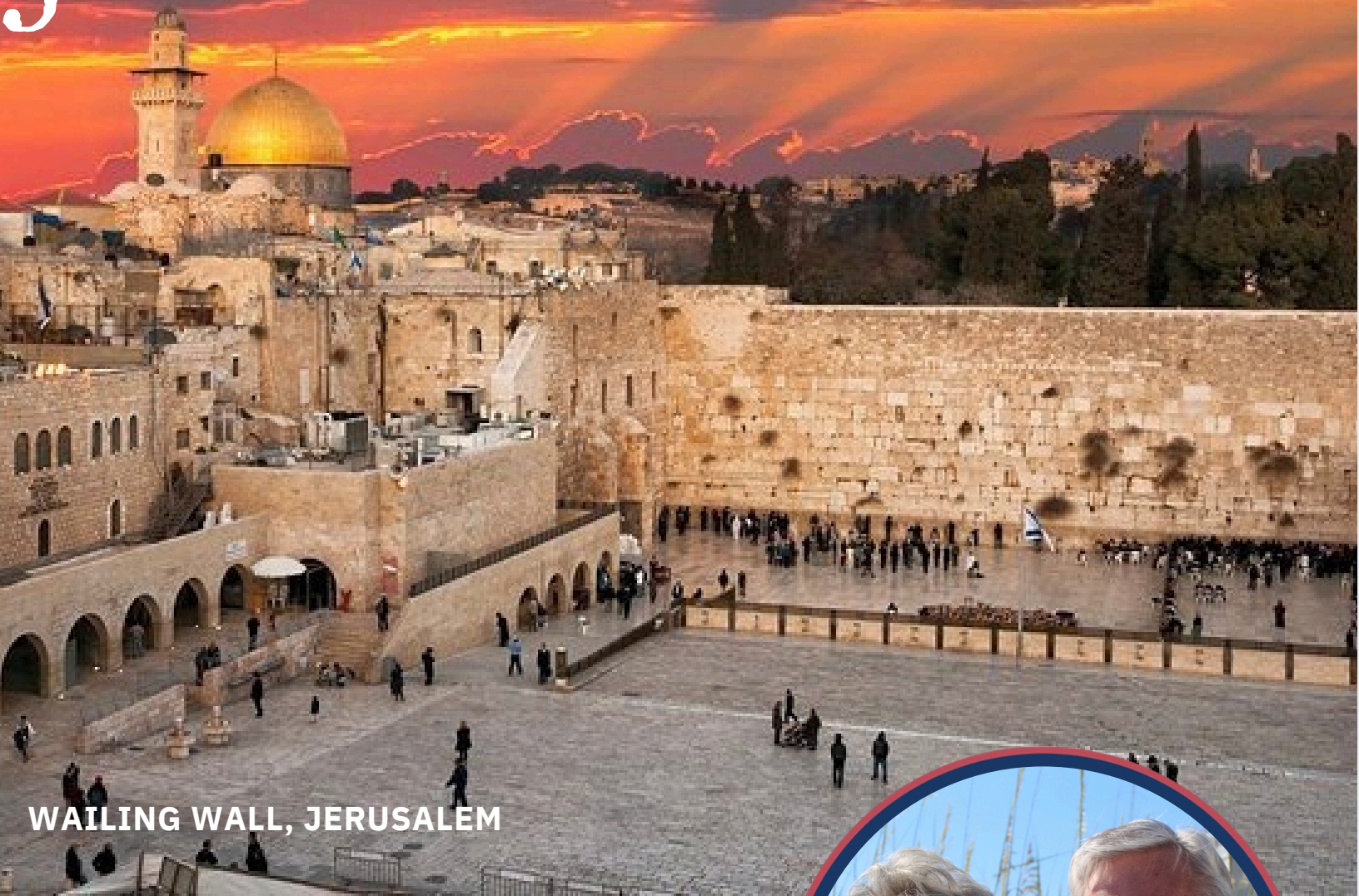
WAILING WALL, JERUSALEM