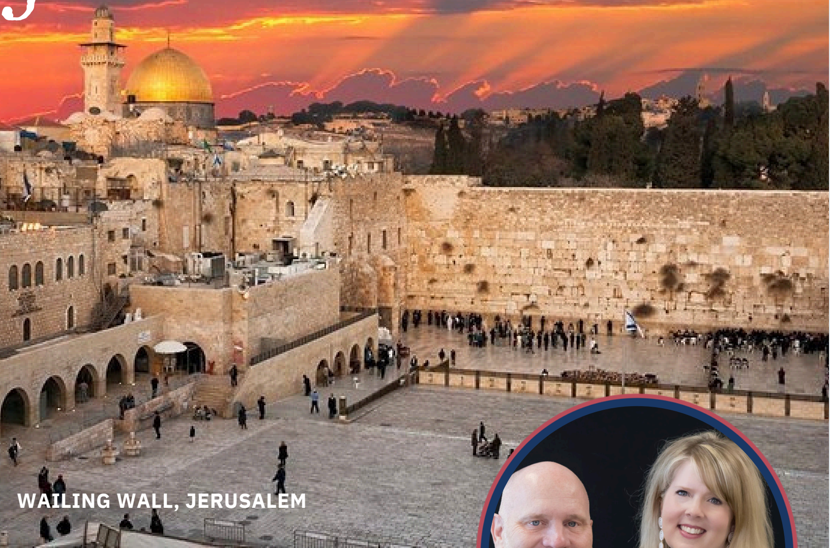
WAILING WALL, JERUSALEM