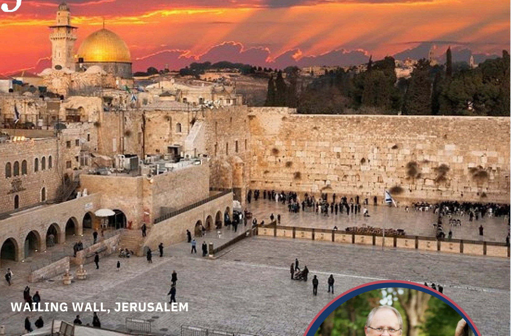
WAILING WALL, JERUSALEM

Experience the rich history and cultural significance of Israel, where the Cornerstone of our Faith taught the way to salvation and made it possible through His loving sacrifice. Embark upon a journey exploring the breathtaking sites integral to the life and death of Jesus of Nazareth, and discover the meaning behind these historical landmarks as you walk in the footsteps of the most influential man in history! Explore the wonders of the Holy Land with its natural beauty and unique architecture, while enjoying inspirational teaching, Christian fellowship, luxury accommodations and splendid cuisine! A lifetime of memories await you!