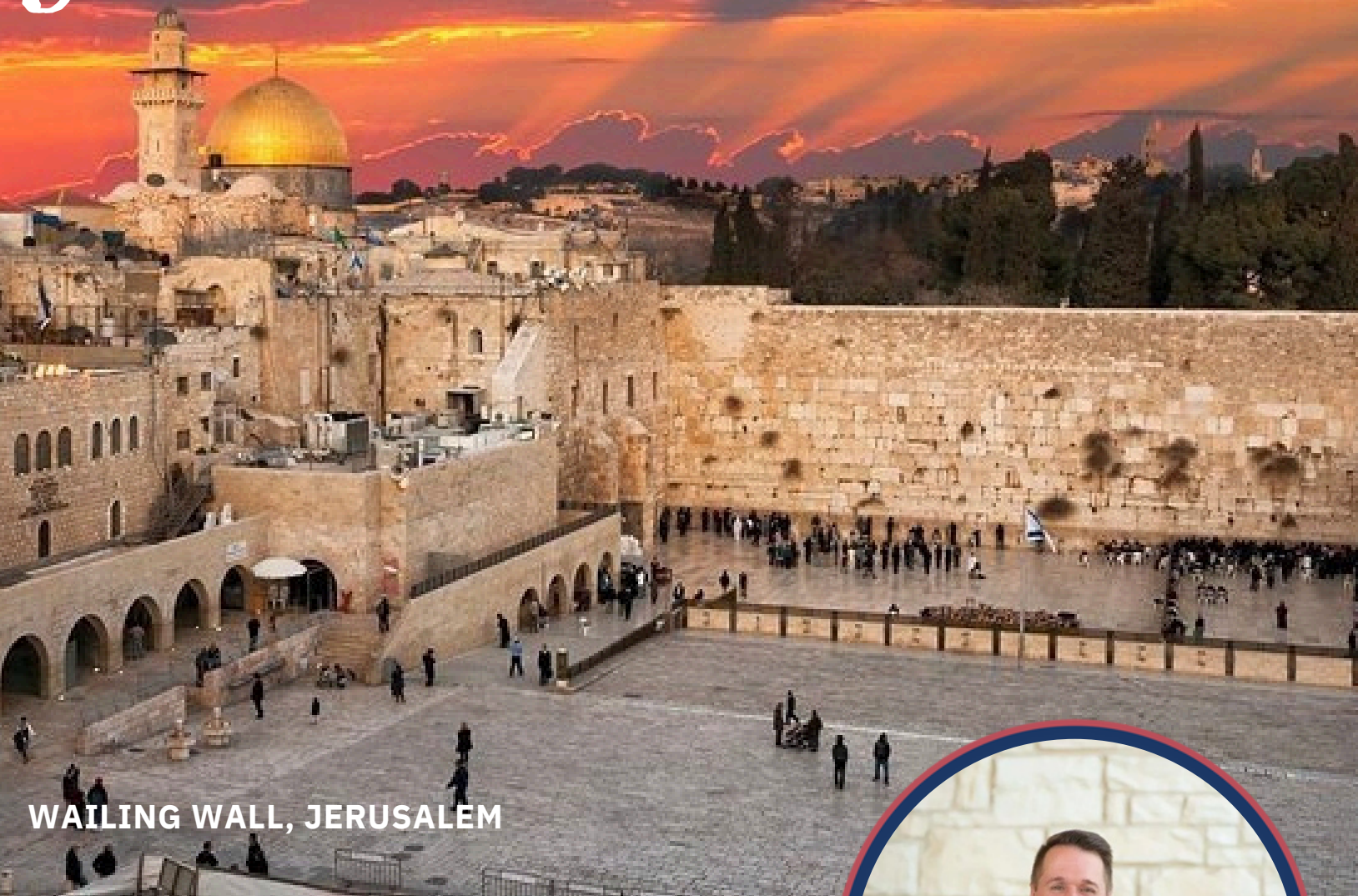
WAILING WALL, JERUSALEM

Experience the rich history and cultural significance of Israel, where the Cornerstone of our Faith taught the way to salvation and made it possible through His loving sacrifice. Embark upon a journey exploring the breathtaking sites integral to the life and death of Jesus of Nazareth, and discover the meaning behind these historical landmarks as you walk in the footsteps of the most influential man in history! Explore the wonders of the Holy Land with its natural beauty and unique architecture, while enjoying inspirational teaching, Christian fellowship, luxury accommodations and splendid cuisine! A lifetime of memories await you!