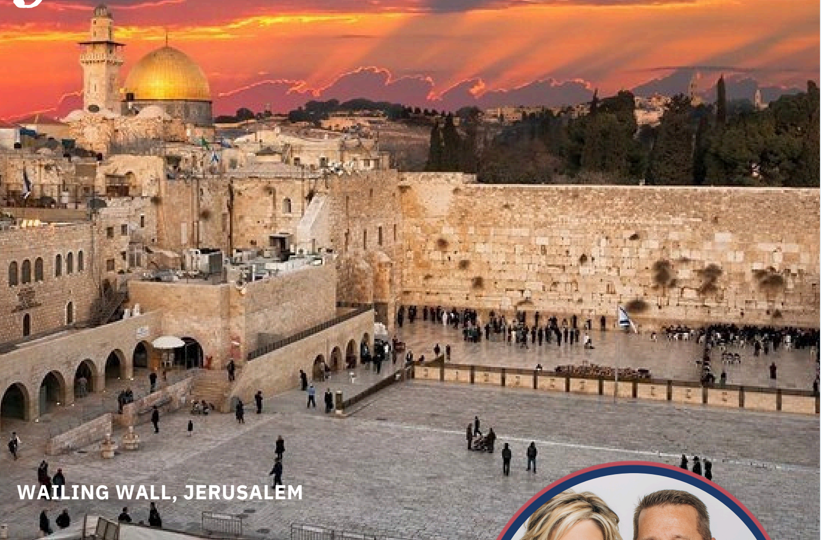
WAILING WALL, JERUSALEM

Experience the rich history and cultural significance of Israel, where the Cornerstone of our Faith taught the way to salvation and made it possible through His loving sacrifice. Embark upon a journey exploring the breathtaking sites integral to the life and death of Jesus of Nazareth, and discover the meaning behind these historical landmarks as you walk in the footsteps of the most influential man in history! Explore the wonders of the Holy Land with its natural beauty and unique architecture, while enjoying inspirational teaching, Christian fellowship, luxury accommodations and splendid cuisine! A lifetime of memories await you!