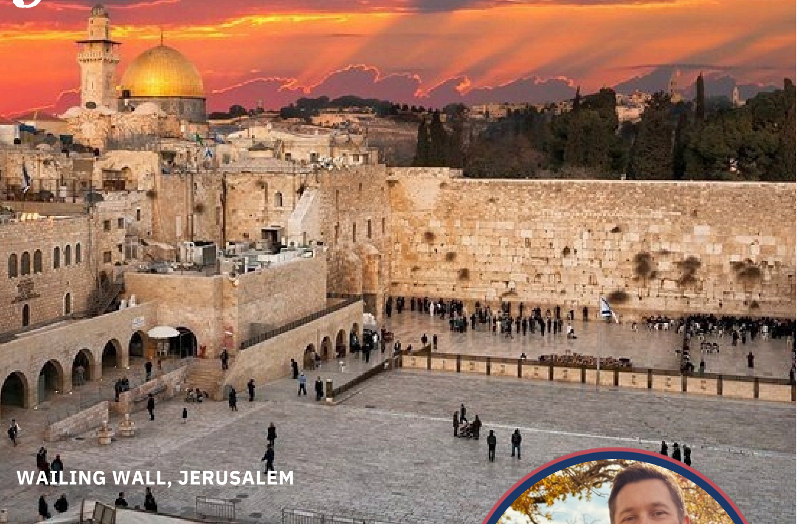
WAILING WALL, JERUSALEM

Experience the rich history and cultural significance of Israel, where the Cornerstone of our Faith taught the way to salvation and made it possible through His loving sacrifice. Embark upon a journey exploring the breathtaking sites integral to the life and death of Jesus of Nazareth, and discover the meaning behind these historical landmarks as you walk in the footsteps of the most influential man in history! Explore the wonders of the Holy Land with its natural beauty and unique architecture, while enjoying inspirational teaching, Christian fellowship, luxury accommodations and splendid cuisine! A lifetime of memories await you!