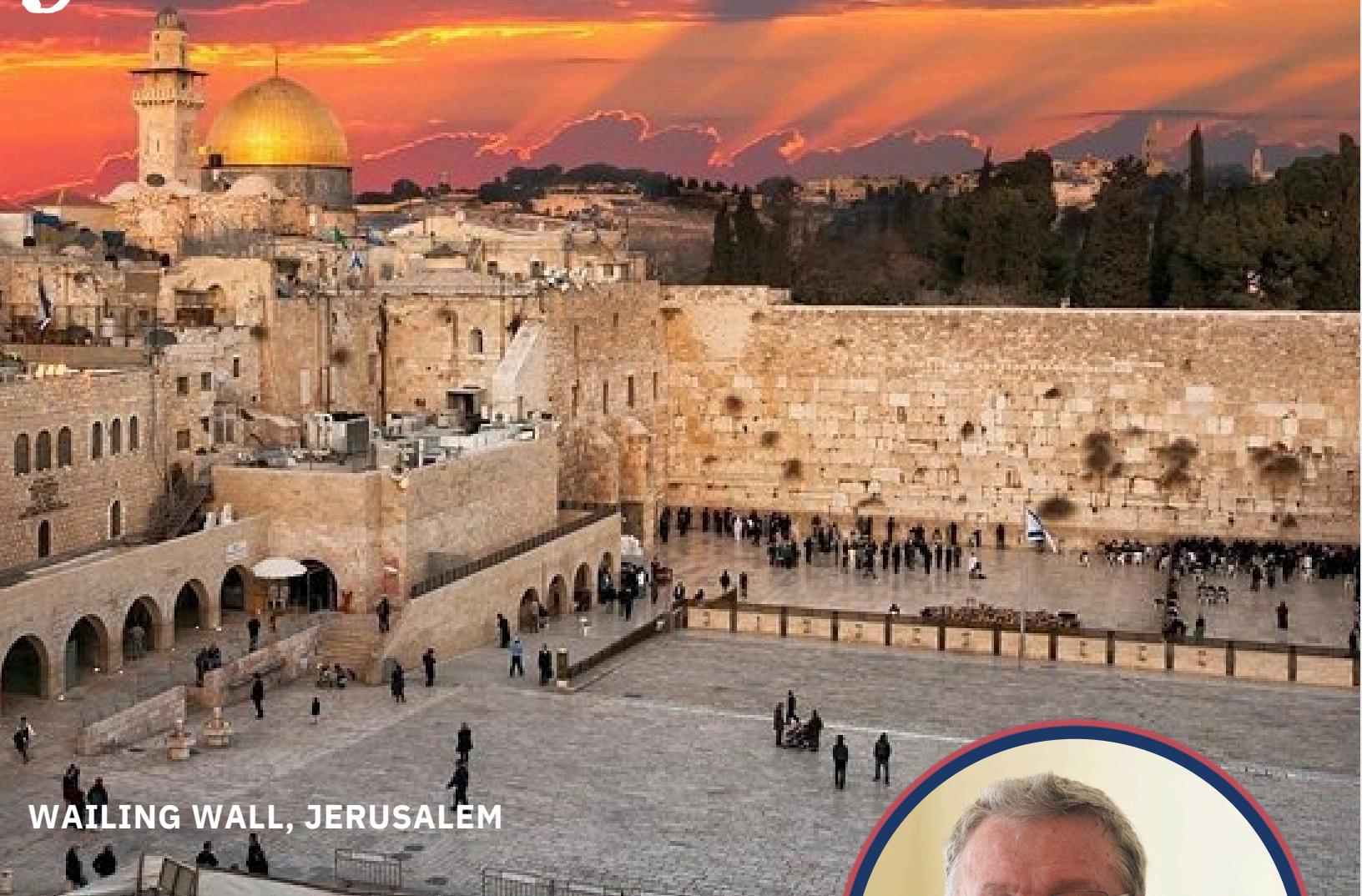
WAILING WALL, JERUSALEM