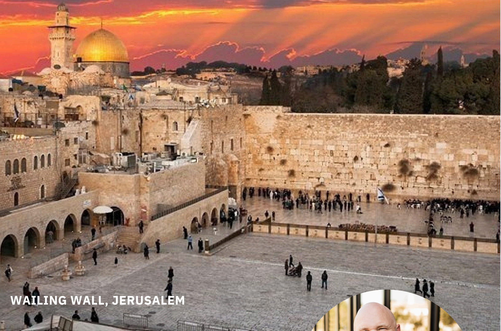
WAILING WALL, JERUSALEM