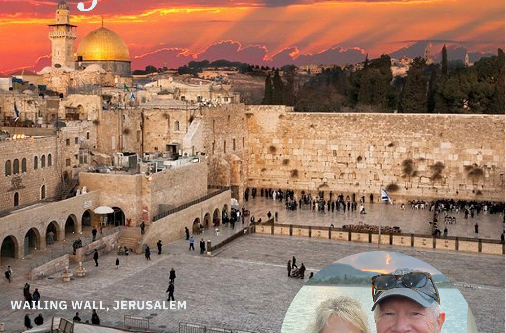
WAILING WALL, JERUSALEM

Experience the rich history and cultural significance of Israel, where the Cornerstone of our Faith taught the way to salvation and made it possible through His loving sacrifice. Embark upon a journey exploring the breathtaking sites integral to the life and death of Jesus of Nazareth, and discover the meaning behind these historical landmarks as you walk in the footsteps of the most influential man in history! Explore the wonders of the Holy Land with its natural beauty and unique architecture, while enjoying inspirational teaching, Christian fellowship, luxury accommodations and splendid cuisine! A lifetime of memories await you!