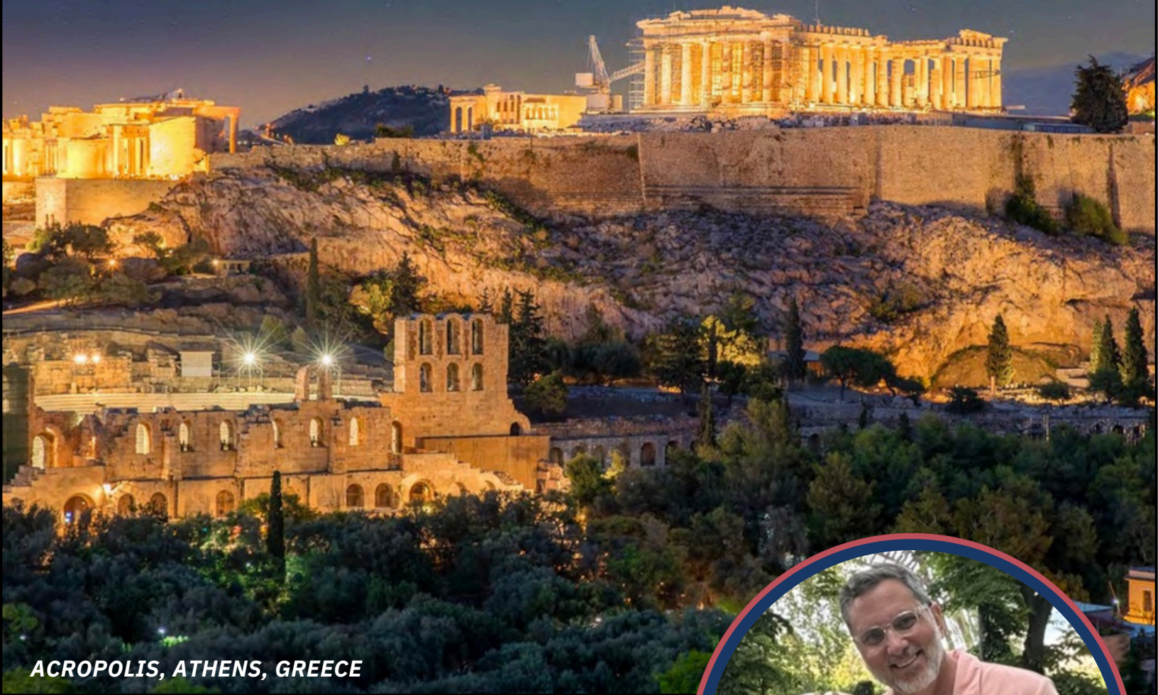
ACROPOLIS, ATHENS, GREECE

We hope you'll join us as we explore the ancient paths of Saint Paul's journeys through Greece and Italy. Walk in the footsteps of this influential figure as you visit iconic sites such as Athens, Corinth, Thessaloniki, and Rome.