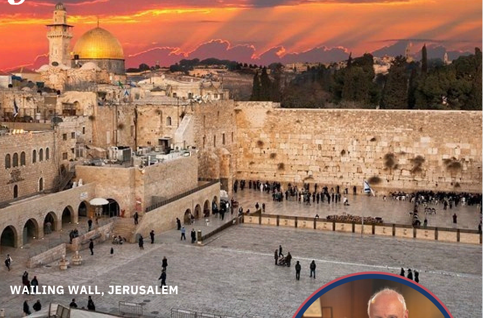
WAILING WALL, JERUSALEM

Experience the rich history and cultural significance of Israel, where the Cornerstone of our Faith taught the way to salvation and made it possible through His loving sacrifice. Embark upon a journey exploring the breathtaking sites integral to the life and death of Jesus of Nazareth, and discover the meaning behind these historical landmarks as you walk in the footsteps of the most influential man in history! Explore the wonders of the Holy Land with its natural beauty and unique architecture, while enjoying inspirational teaching, Christian fellowship, luxury accommodations and splendid cuisine! A lifetime of memories await you!