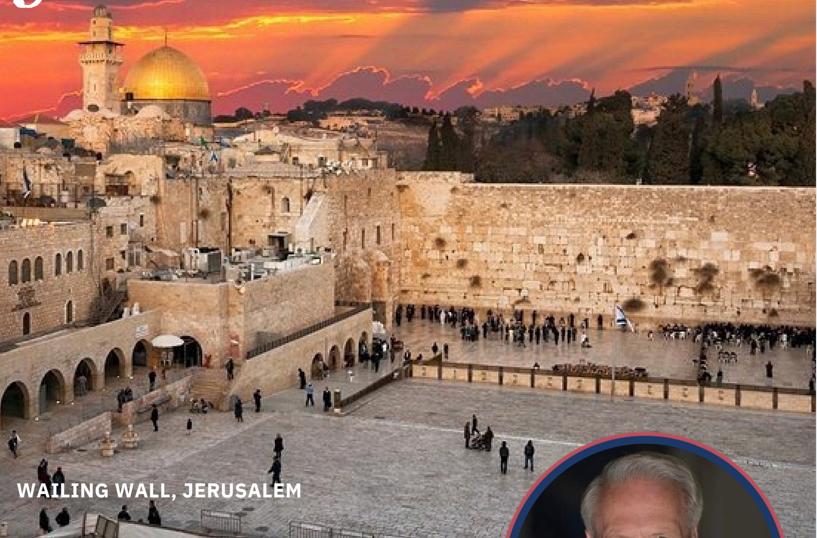
WAILING WALL, JERUSALEM